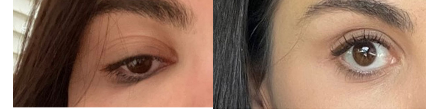
Figure 2: A - 36-48 hours after Pfizer vaccine booster. note the inflamed and swollen skin overlying the infraorbital and tear duct. B - The eye of the same patient two weeks after under eye filler hyaluronidase dissolution. (Obagi S, Obagi Z, Altawaty Y, Obagi Z)

Sources: Ramasamy et al., 2021 ; US Food Administration information documents for Pfizer-BioNTech and Modern COVID-19 vaccines.